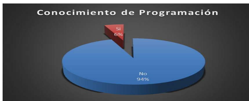
Figure-2. Participants with programming knowledge.

Approximately 360 preschool, primary, secondary, telesecondary, and Colegio de Bachilleres del Estado de Jalisco (COBAEJ, Guadalajara, Mexico) students participated; 94% had utilized computers in order to access Paint, word processing, Excel, PowerPoint, social networks or, simply, to play, and 6%, that is, 20 students of the 360 participants in Hour of Code had already engaged in programming during their undergraduate university studies Figure 2.