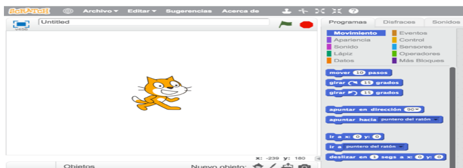
Figure-3. Scratch, developed by the Massachusetts Institute of Technology (MIT), Cambridge, MA, USA.

Some of the programming languages utilized are Scratch, which is oriented toward the development of small animations, applications, and games. It has been developed by and for children and the educative environment and is free of charge Figure 3 .