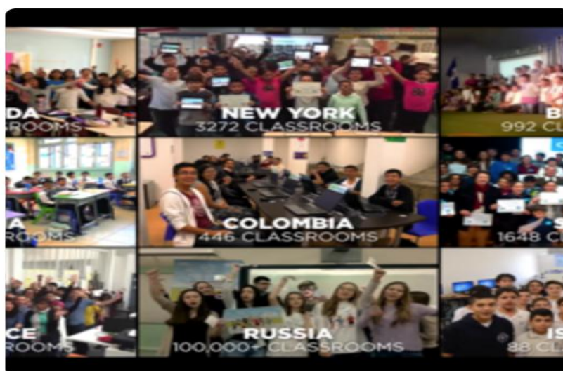
Figure-1. global movement of the Hour of Code.

Hour of Code offers activities in different areas and multiple hardware needs to students at any level. In Figure 1, we present an illustration of this global movement.